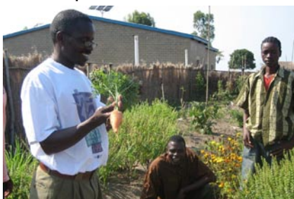
Jumbo & Godrick admiring our carrots

The Temwa Demonstration Garden in Usisya has been providing members of staff working on the garden with an abundance of vegetables. The small-scale irrigation techniques trialled in the