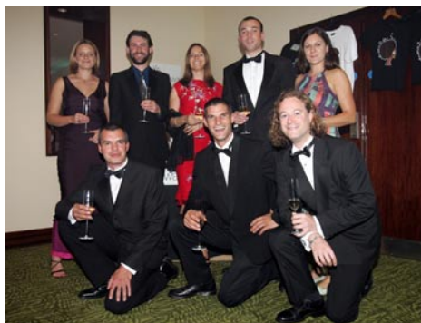
The Temwa team at the CVS Ball